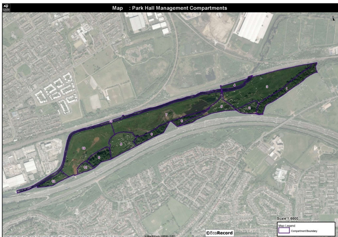
Map 2 – Park Hall Reserve land parcels