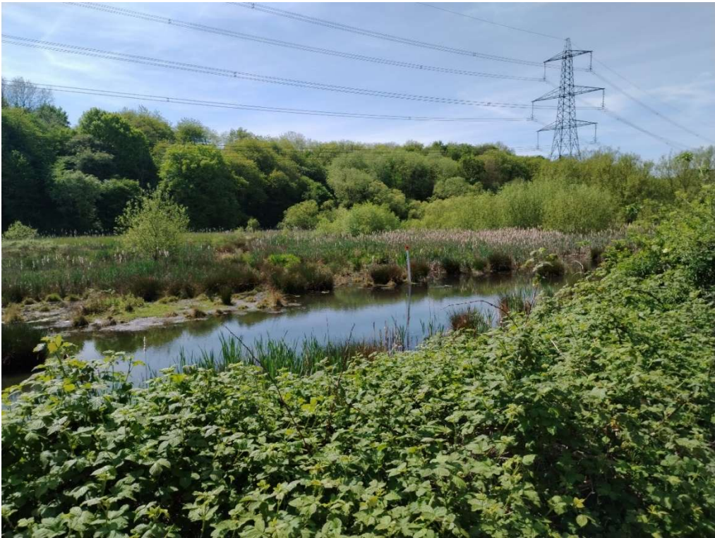
Park Hall site – central wetland area