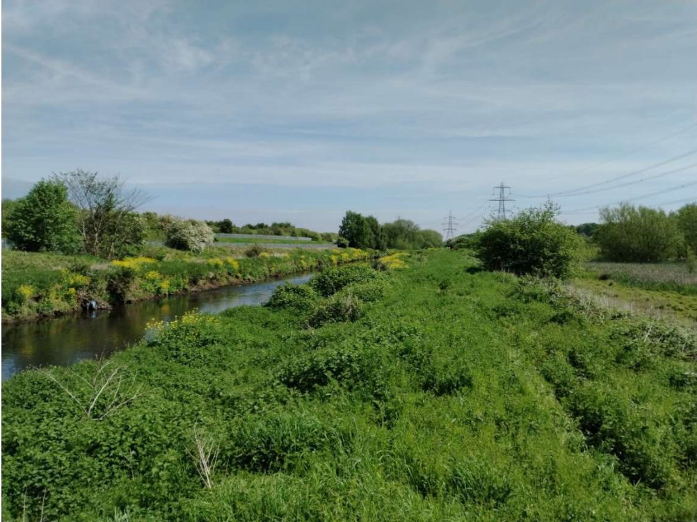
Park Hall site – River Tame, looking east