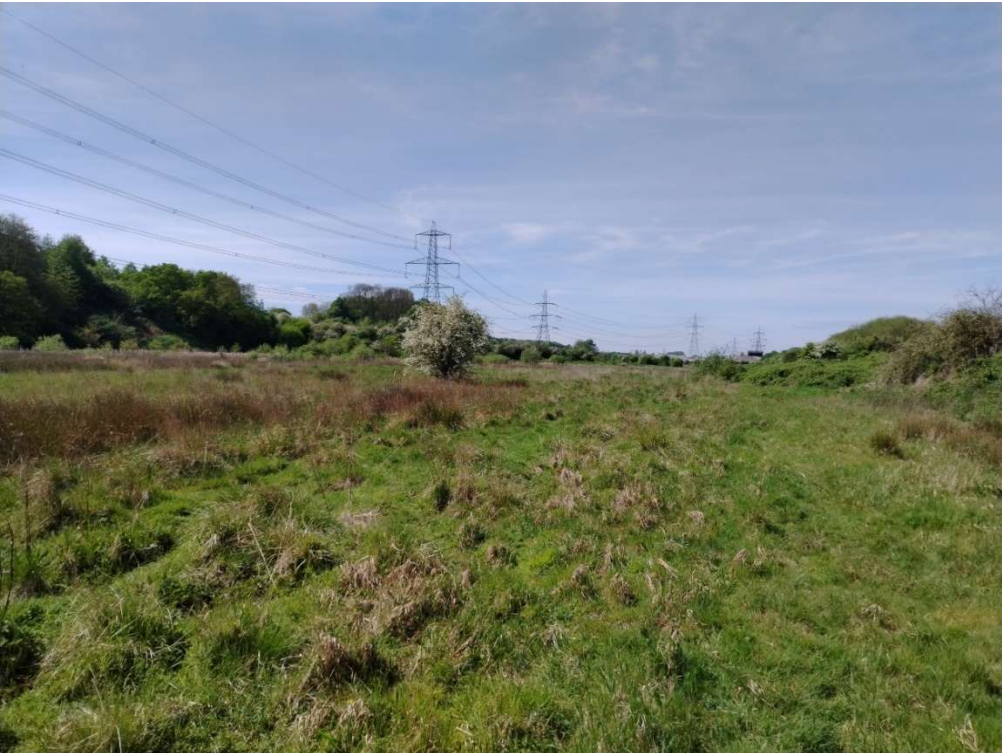
Park Hall site - west