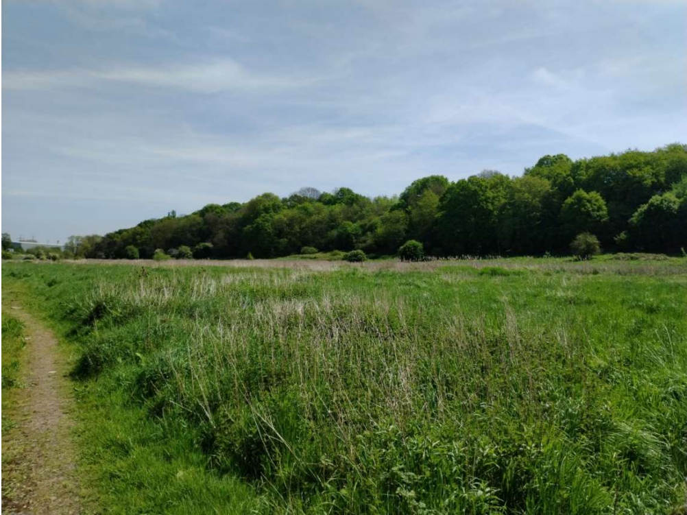
Park Hall site - East