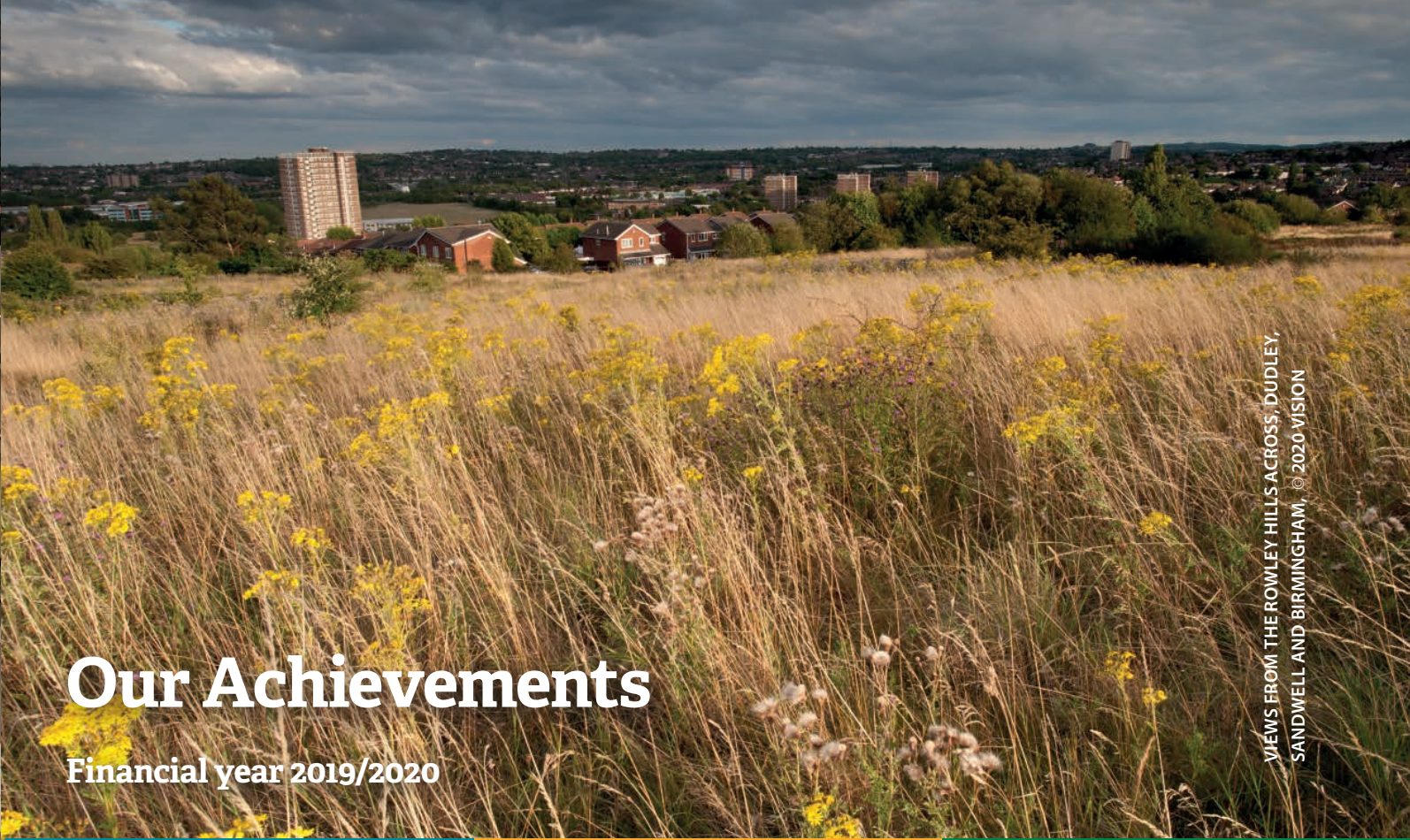
VIEWS FROM THE ROWLEY HILLS ACROSS, DUDLEY, SANDWELL AND BIRMINGHAM, © 2020 VISION