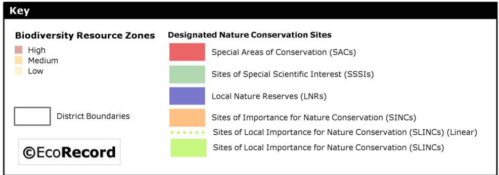
Figure 1: Biodiversity Resource Map