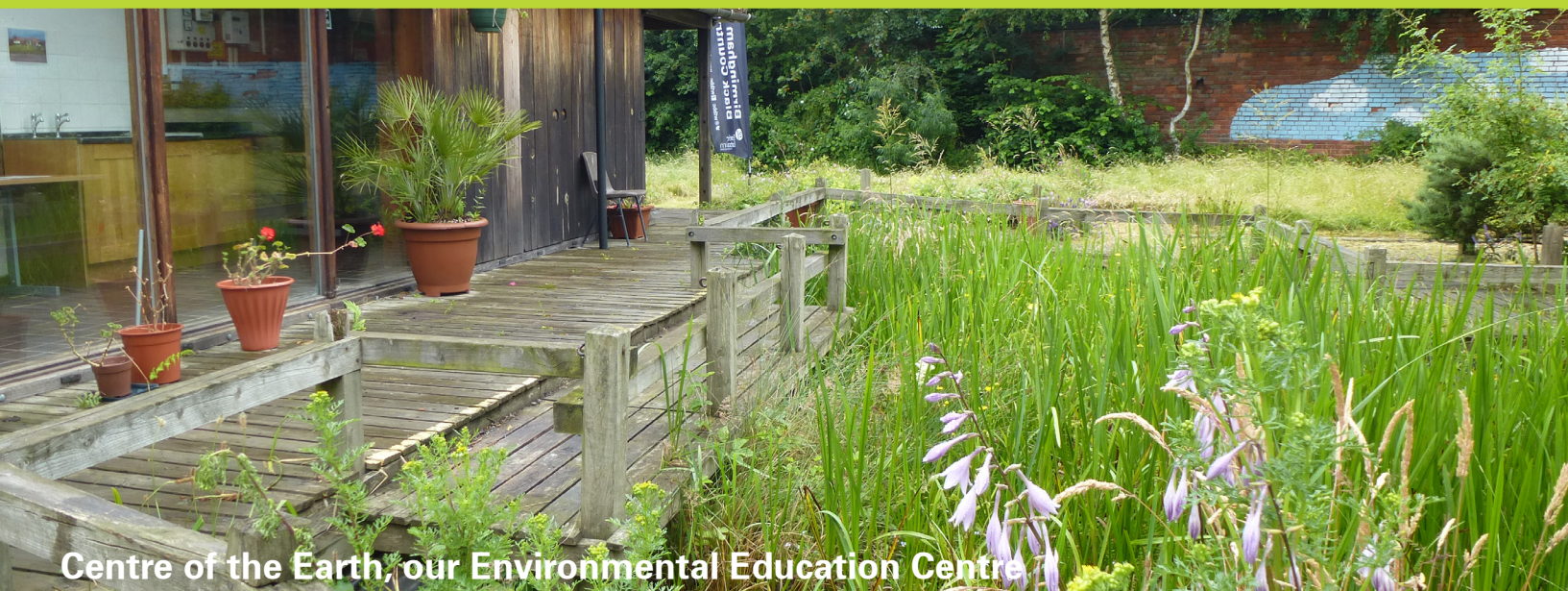
Centre of the Earth, our Environmental Education Centre

Our mission is to work with schools and families to make sure the next generation grows up connected to the natural world. We have 3 FREE school offers to achieve this alongside the paid programmes and support we provide.