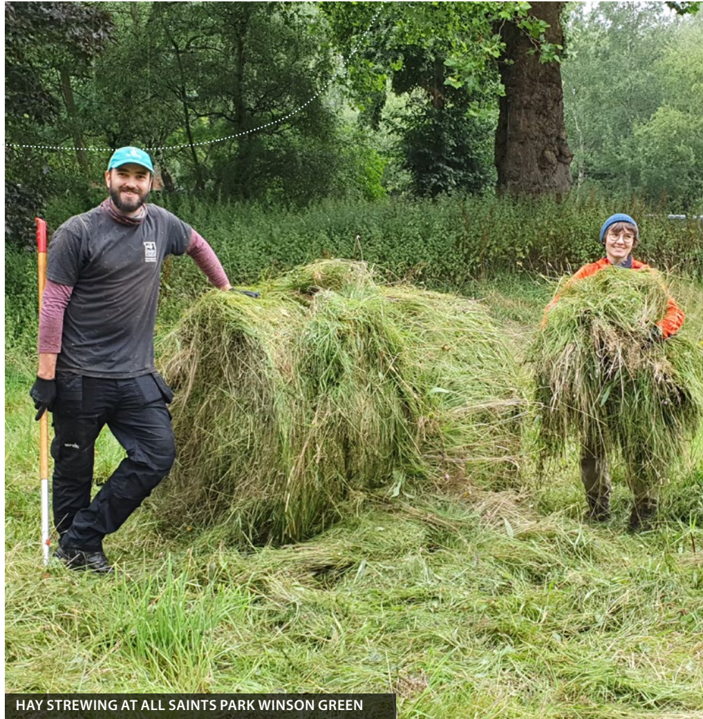
HAY STREWING AT ALL SAINTS PARK WINSON GREEN

We advised 93 land managers on an area of land covering a total of 1,010 hectares and an additional 20 kilometres of watercourse. Over 750 hectares of this land and all of the watercourse length are designated as Sites of Importance for Nature Conservation (SINCs) or Sites of Local Importance for Nature Conservation (SLINCs).