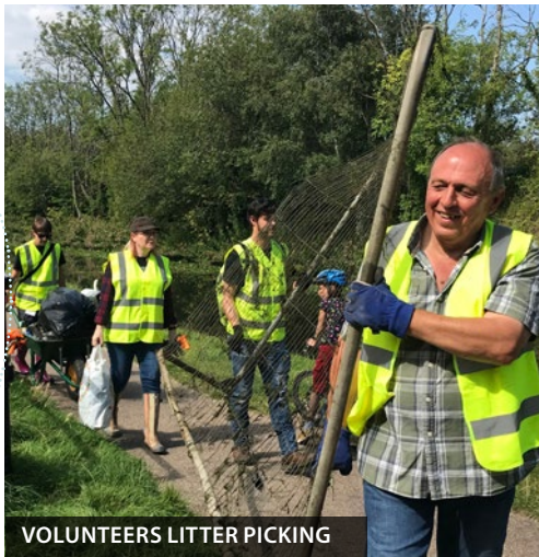
VOLUNTEERS LITTER PICKING