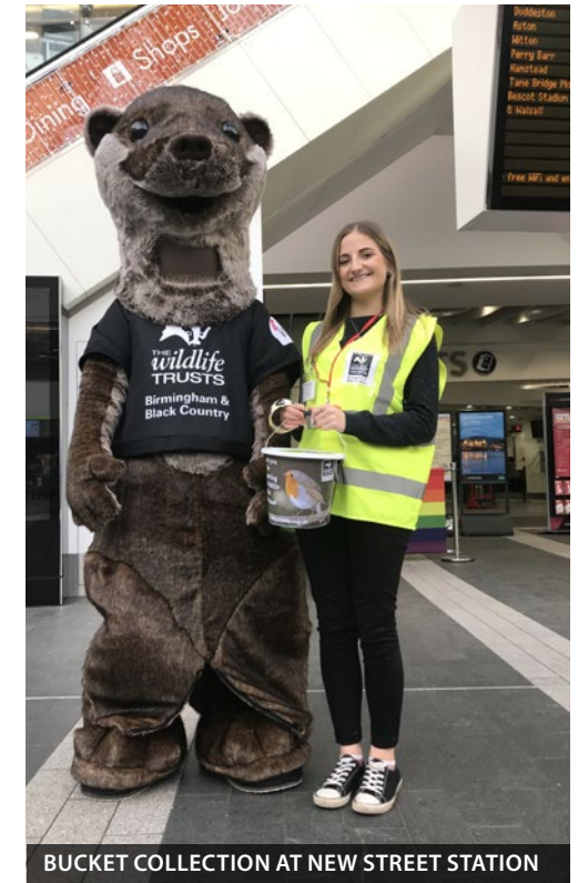
BUCKET COLLECTION AT NEW STREET STATION

The Esmée Fairbairn Foundation supports the Trust to deliver biodiversity improvement projects in areas of public open space across Birmingham and the Black Country. In 19/20 45 biodiversity projects were delivered which included meadow creation, woodland enhancement, river restoration and hedgerow planting. Thanks to funding from the Esmée Fairbairn Foundation we were also able to purchase a bespoke otter mascot which was a great addition to our events and fundraising activities.