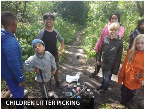
CHILDREN LITTER PICKING