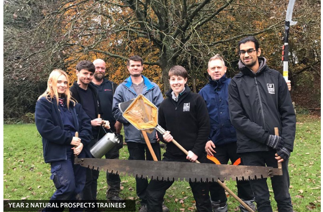
YEAR 2 NATURAL PROSPECTS TRAINEES